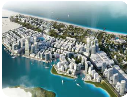
Al Zorah Infrastructure, Ajman