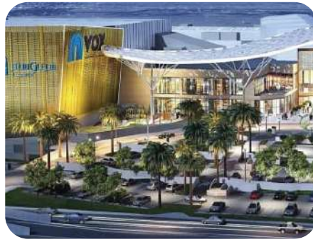
Al Zahia City Center, Sharjah