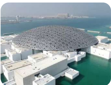
Louvre Museum, Abu Dhabi