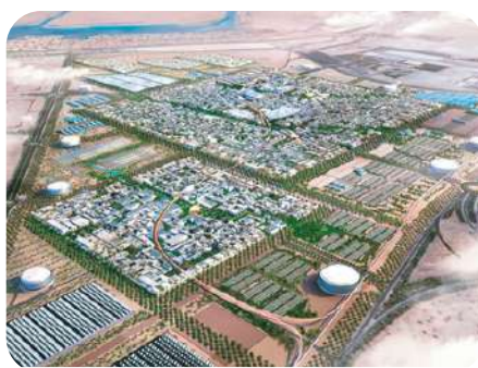
Masdar City, Abu Dhabi