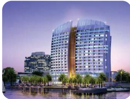
InterContinental Grand Marina Hotel Abu Dhabi