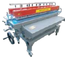
Sheet Butt Welders