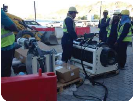
Public Works in Oman