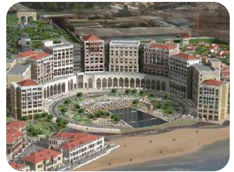
Ritz Carlton Hotel Expansion, Dubai