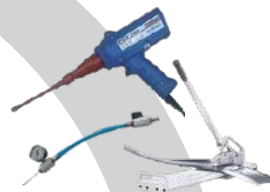
Testing & Tools