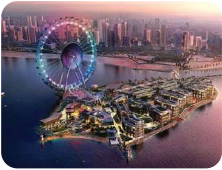
Blue Waters, Dubai

Below are some Projects References where HÜRNER GULF has supplied ELOFIT HDPE pressure fittings for water & gas up to 630 mm, POLYSYSTEM PPR pipes & fittings for hot & cold water supply up to 250 mm and HÜRNER Butt welding machines up to 1200 mm.