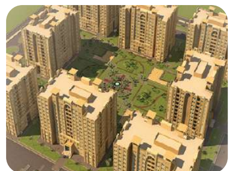
Ruwais Housing Complex Phase III, Abu Dhabi