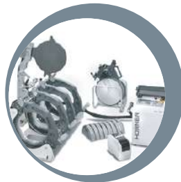
HÜRNER better welding