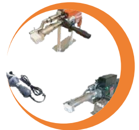
HSK HOT AIR WELDING