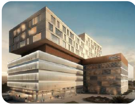
Clemenceau Medical Center, Dubai