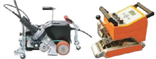
Automatic Wedge & Hot Air Welders