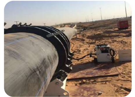
1200 mm Water Pipeline Sharjah to Ras Al Khaimah