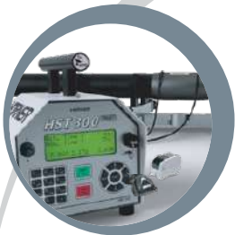
HÜRNER better welding