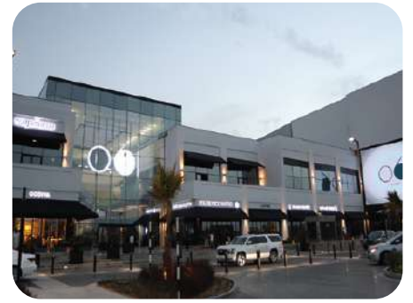
Zero 6 Mall, Sharjah