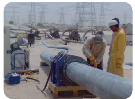
Water pipeline in Barsha, Dubai