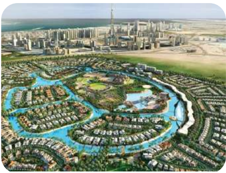
Mohammad Bin Rashid City, Dubai