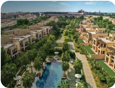
Mina Al Arab, Ras Al Khaimah