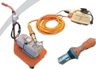
Hot Air Welding, Compactors and Blowers