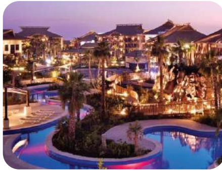
Lapita Dubai Park Hotel, Dubai