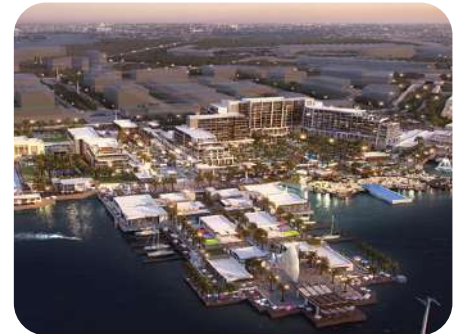
Yas Family Hotel Hilton Abu Dhabi