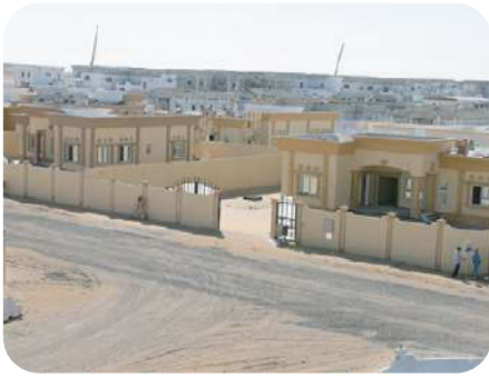
Al Hayer Emirati Housing Complex, Al Ain