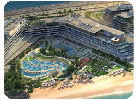
W. Hotel, Palm Jumeirah, Dubai