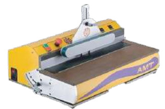
Acrylic Sheet Polisher