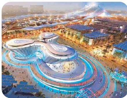
Expo 2020, Dubai