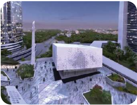
DIFC Gate Avenue, Dubai